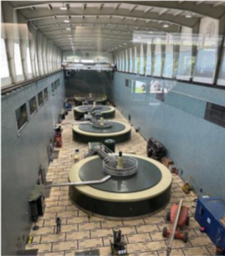
Turbines at Chickamauga Dam