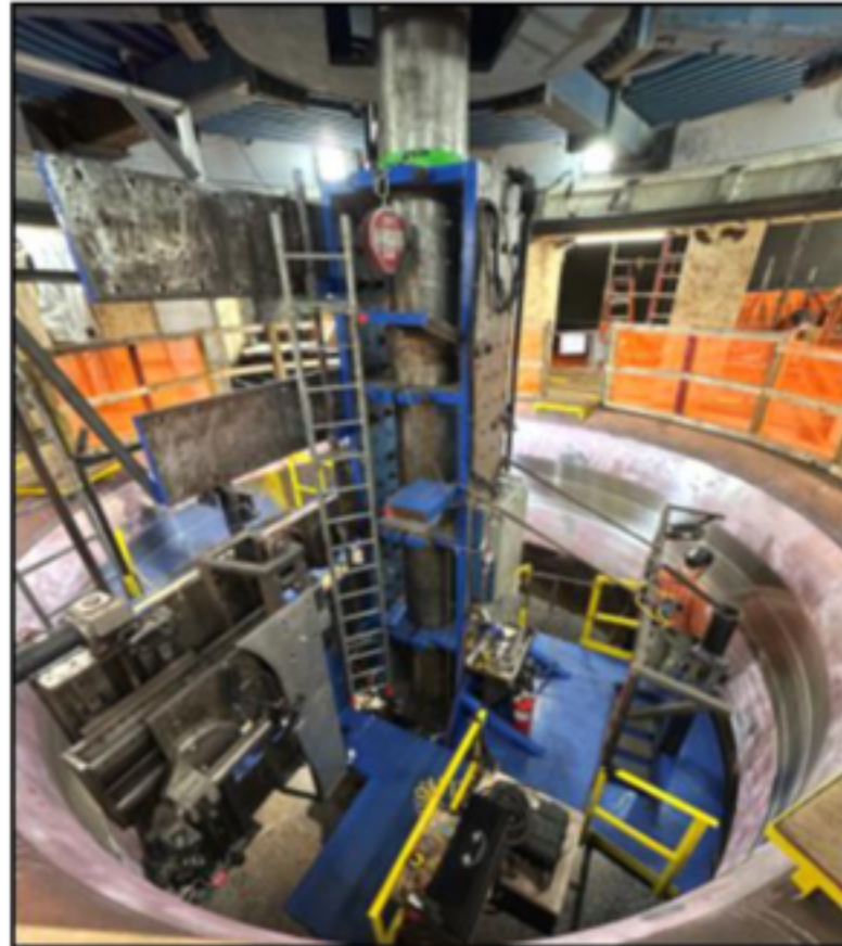
Fort Loudoun Unit 2 turbine boring bar