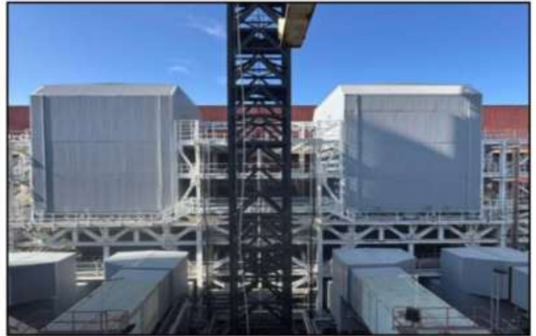
Units 2, 3, 7, & 8