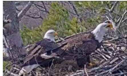
Mother and Father Eagle are preparing the nest near Winged Deer Park in Johnson City.

It's nearly Valentine's Day and our favorite local American bald eagle duo is already feeling the love. The couple, who make their home near Winged Deer Park, delighted people from around the world last spring as they raised their young eaglet in real-time. If they follow last year's pattern, eggs will show up shortly, then one or two eaglets should arrive in March. Watch the popular "EagleCam" (now with two cameras) at http://www.etsu.edu/cas/biology/eagle-cam/cameras.php .