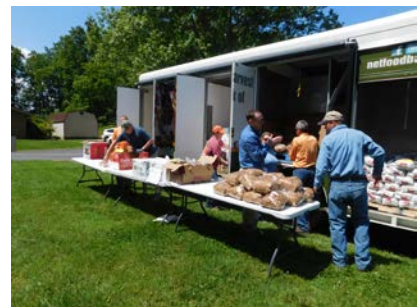
TVA and Elizabethton Electric workers preparing to assist some 50 Elizabethton families with the Second Harvest Mobile Food Pantry.