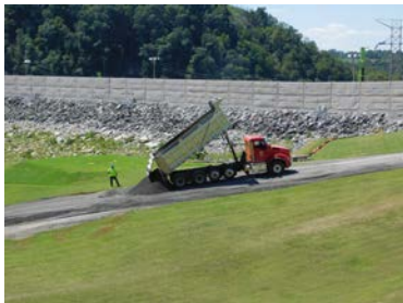
Above: Building the access road prior to upstream berm construction.