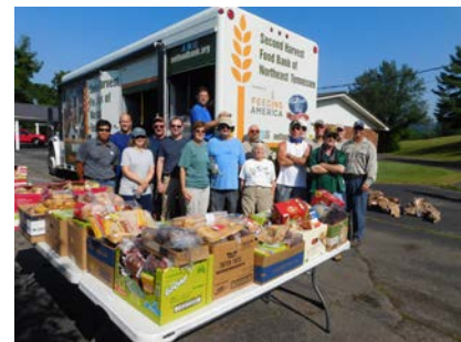
TVA representatives distributed food at the Mooresburg Second Harvest Mobile Food Pantry along with volunteers from Holston Electric Cooperative and the local community.

Last Chance for Summer Fun! Get your last-minute summer fun photos in before our contest ends Sept. 11. Be sure to use the hashtag #TVAFun when you upload your photos to social media in order to win some great prizes. Visit TVA.com/TVAFun for details.