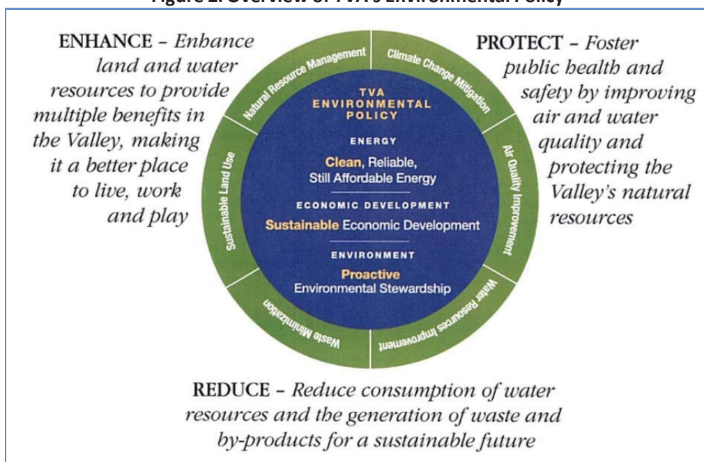
Figure 2: Overview of TVA's Environmental Policy

TVA will lead in reducing the environmental impact of its operations (including procurement, acquisition, real property or leasing decisions) and in protecting and enhancing the Valley's natural resources.