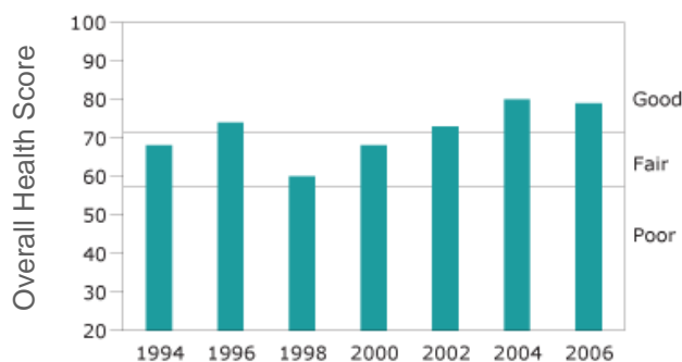
Figure 3. Watauga Reservoir Ecological Health Ratings, 1994-2006

The Reservoir Ecological Health Index is made up of several component indices: dissolved oxygen, chlorophyll, fish (i.e., Reservoir Fish Assemblage Index [RFAI]), bottom life, and sediments. The scores from these indices are totaled, and then the average is taken to come up with the overall reservoir ecological health score. Figure 3 shows the reservoir ecological health scores for Watauga Reservoir from 1994 through 2006. Areas sampled on Watauga Reservoir include the forebay at Watauga RM 37.4 and the transition zone at Watauga RM 45.5.