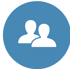
Staff Capacity and Experience