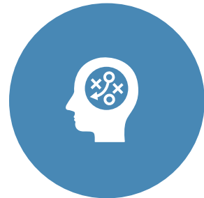
Funding Identification and Planning

In our conversations with community representatives, many indicated that their communities experience barriers that inhibit their ability to make meaningful progress in securing funding. Specifically, they experience difficulty in the following areas: