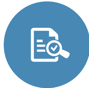
Navigating Funding Requirements