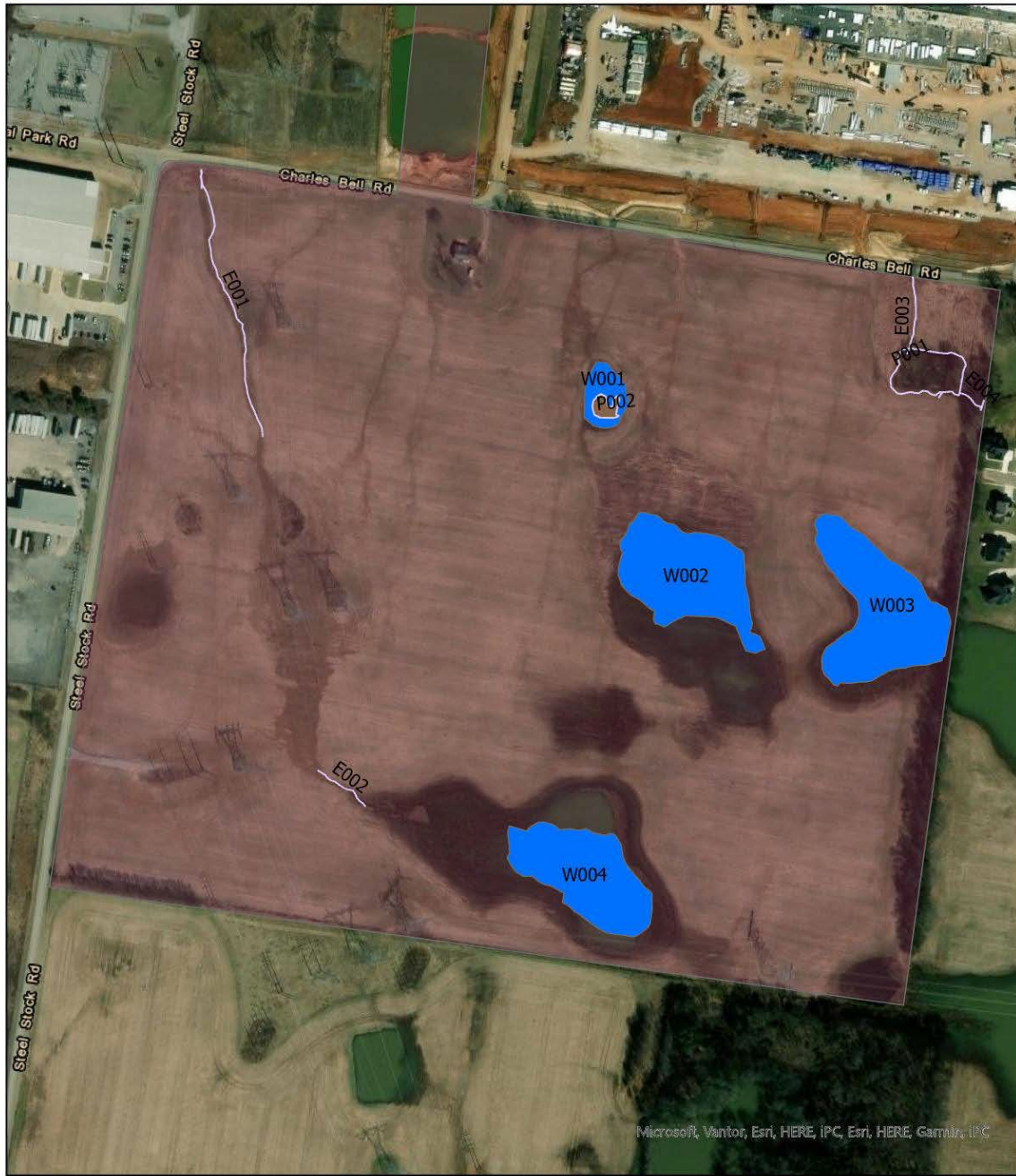
Figure 1. Proposed Substation Parcel Showing Wet-Weather Conveyances/Ephemeral Streams, Ponds, and Wetlands (Updated November 2025)