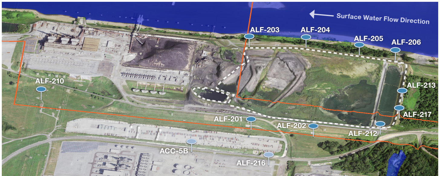
Image shown is a rendering, well locations are approximate.

We maintain a robust network of monitoring wells that we sample regularly for groundwater quality. Many of the constituents in coal ash are naturally occurring in rocks and soil, which makes it important to understand groundwater quality before it reaches the site. That's why we typically install monitoring wells both before and after groundwater reaches the site. We proactively report the results to regulators and post the results on the TVA website.