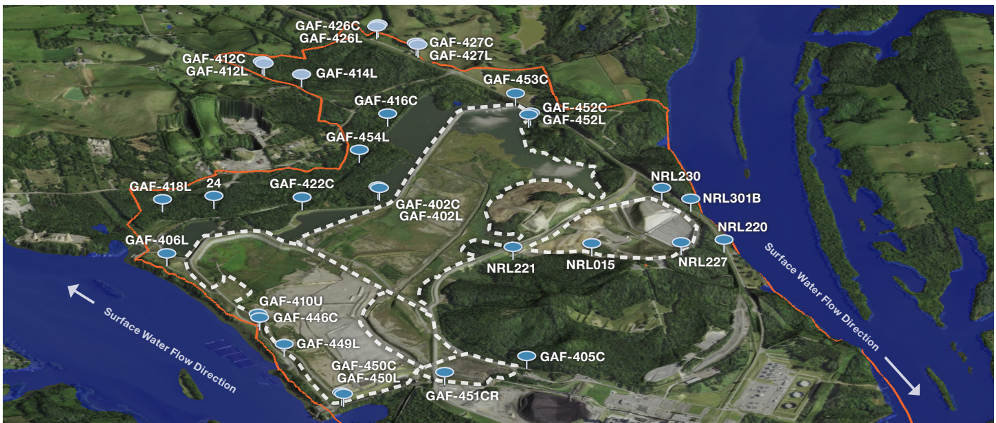
Image shown is a rendering, well locations are approximate.

We maintain a robust network of monitoring wells that we sample regularly for groundwater quality. Many of the constituents in coal ash are naturally occurring in rocks and soil, which makes it important to understand groundwater quality before it reaches the site. That's why we typically install monitoring wells both before and after groundwater reaches the site. We proactively report the results to regulators and post the results on the TVA website.