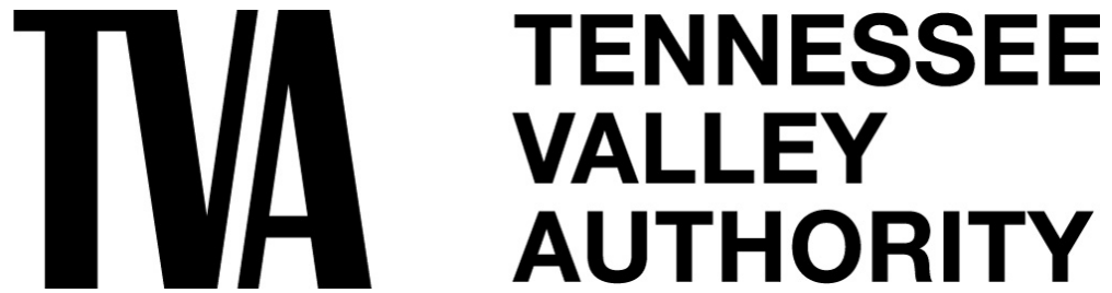
Exhibit G Template Proposal Requirements Submittal

2022 Carbon-Free RFP TVA Solar, LLC Proposal